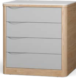
4-drawer chest with Clean-Tec top 1AUC-160 32.9H | 31.9W | 19D (")