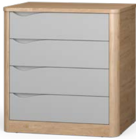
4-drawer chest 1AUC-400 32.9H | 31.9W | 19D (") Weight: 180.5 lbs.