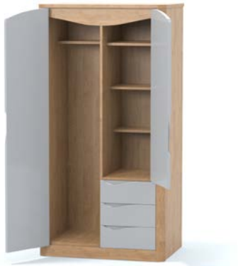
Combination wardrobe 1AUWC-200 70.8H | 36.4W | 25D (") Weight: 306.5 lbs.