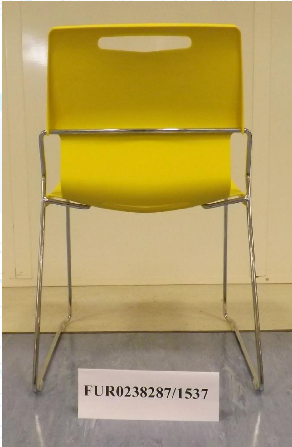
Rear view of the 'Touch Chair'