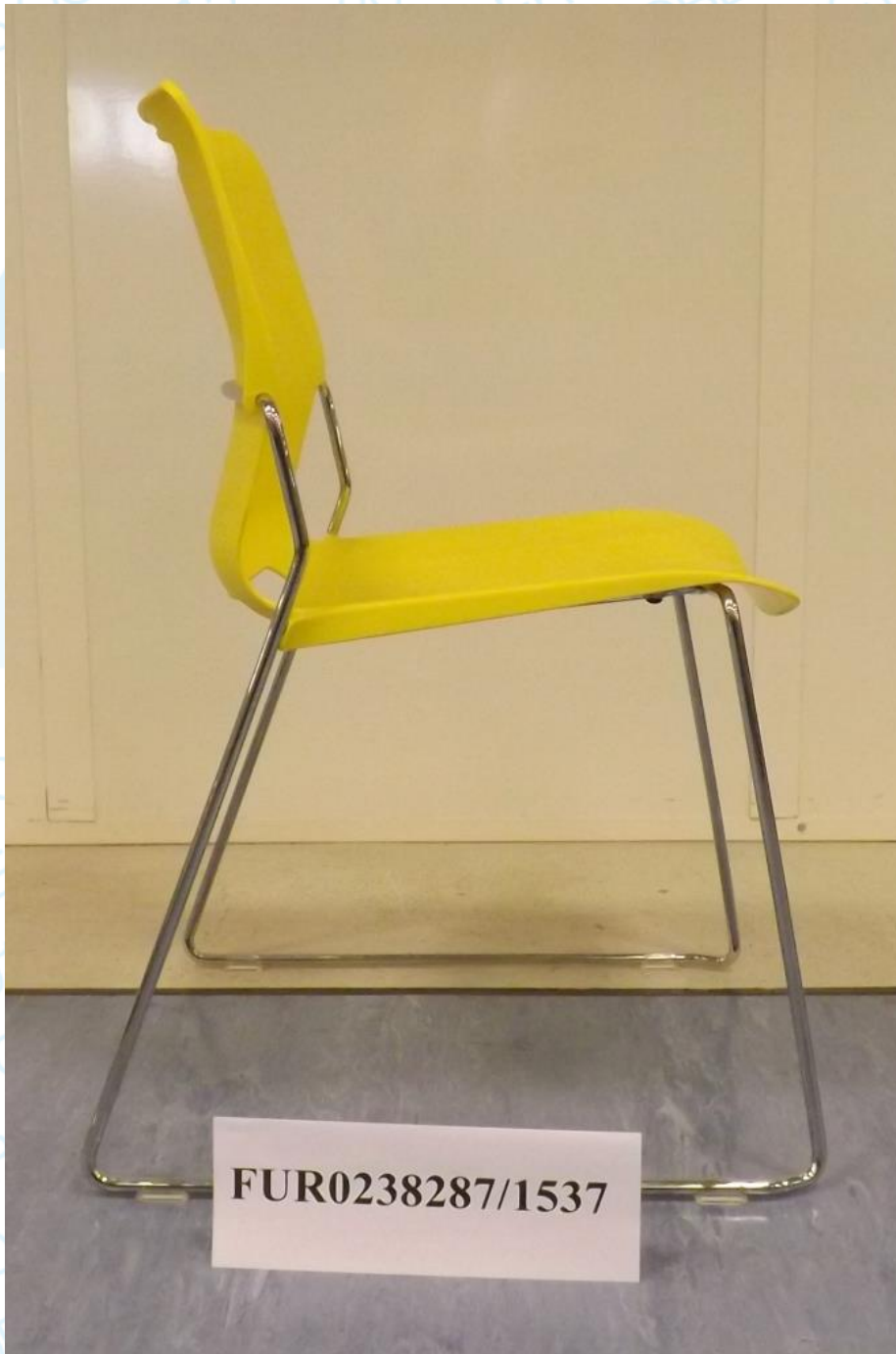
Side view of the 'Touch Chair'