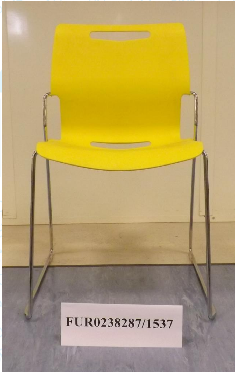
Front view of the 'Touch Chair'