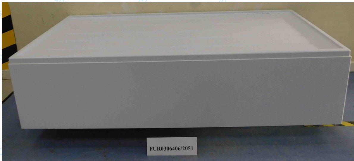
Side view of the 'Sovie'

Note 1: At the request of the customer, the static loads were increased to 4905N (500kg)