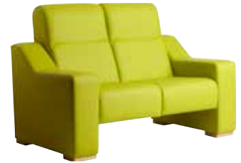
Liberty 2-seater 1LY2-300 40.9"H | 60.6"W | 35.4"D Seat height: 18.9" Weight: 242.5 lbs.