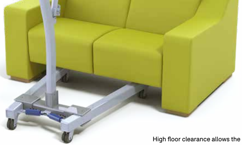
High floor clearance allows the use of hoists to manoeuvre less mobile patients

Our Liberty range is designed with built-in features that enhance hygiene, accessibility and inspection.