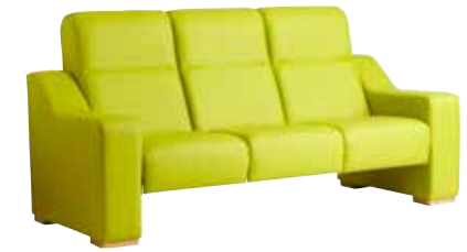
Liberty 3-seater 1LY3-300 40.9"H | 81.9"W | 35.4"D Seat height: 18.9" Weight: 316.4 lbs.