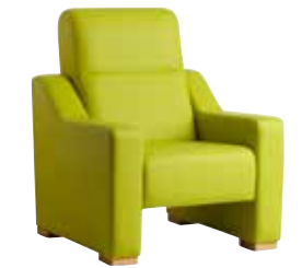
Liberty chair 1LY1-300 40.9"H | 33.5"W | 35.4"D Seat height: 18.9" Weight: 162 lbs.