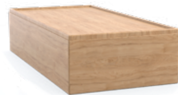
Sovie single box bed 1SVEA-100-80 18.5"H | 83"L | 38.5"W Weight: 265 lbs.