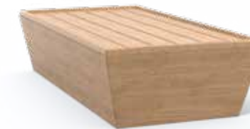
Sovie bariatric single bed 1SVFA-100-80 19"H | 83"L | 47"W