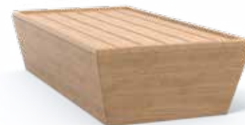
Sovie Flare single bed 1SVFA-100-80 19"H | 83"L | 39"W Weight: 240 lbs.