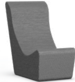
Zen Plus duo chair 1ZENDP-400 39.4"H | 23.6"W | 39"D Weight: 91.5 lbs.