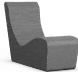
Zen Plus chair 1ZENP1-400 39.4"H | 23.6"W | 58.5"D Weight: 135.5 lbs.