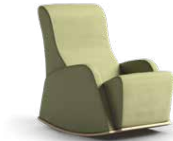
Zen Plus rocker chair 1ZENRP1-400 40"H | 26"W | 44"D Weight: 130 lbs.