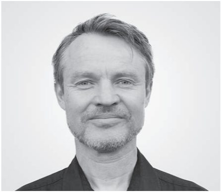
Designed by Magnus Nero

Doorne is an adaptable seating system designed to help you make the most of your space.