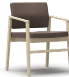
Cadrega lounge low back chair 1CGL1-400 33.4H | 23.6W | 25.9D (inch) Seat height 19.2 inch Weight: 22lbs