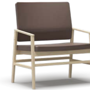
Cadrega lounge bariatric chair 1CGB1-200 39.9H | 34.2W | 25.9D (inch) Seat height 19.2 inch Weight: 35.2lbs