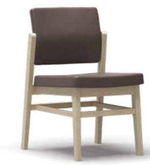
Cadrega dining chair without arms 1CGD1-300 31.4H | 19.6W | 21.8D (inch) Seat height 17.3 inch Weight: 18.7lbs