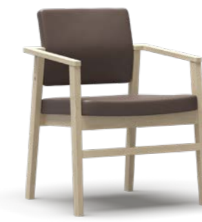
Cadrega dining chair with arms 1CGD1-400 31.4H | 23.6W | 21.8D (inch) Seat height 17.3 inch Weight: 19.8lbs