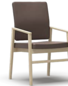
Cadrega lounge high back chair 1CGH1-400 47.2H | 23.6W | 25.9D (inch) Seat height 19.2 inch Weight: 25.3lbs