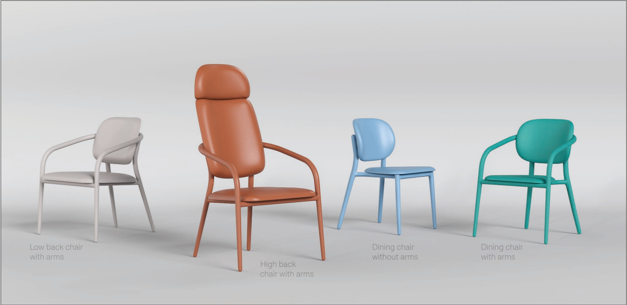
Low back chair with arms