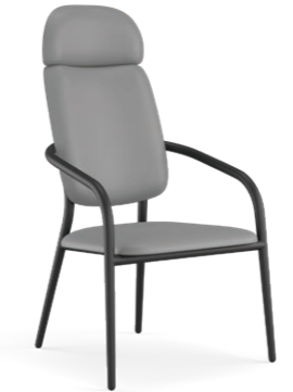
Appa Lounge high back chair with arms 1AXL-400 46.8H | 25.8W | 27D (in) Seat height: 19in Weight: 30.9lbs

Supportive high-back options for extra comfort