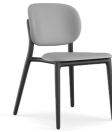
Appa dining chair without arms 1AX1-100

31.8H | 20.9W | 21.9D (in) Seat height: 19in Weight: 17.4lbs