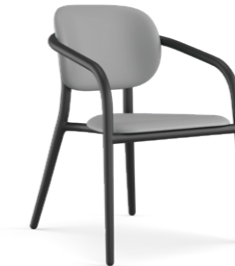
Appa dining chair with arms 1AX1-200

31.8H | 20.9W | 21.9D (in) Seat height: 19in Weight: 17.4lbs