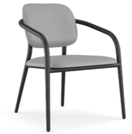
Appa Lounge low back chair with arms 1AXL-300 32H | 26W | 25.7D (in) Seat height: 19in Weight: 26.5lbs